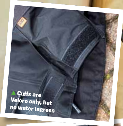
▲ Cuffs are Velcro only, but no water ingress

Some jackets and trousers come with zip-in thermal liners; some don't on the grounds many owners prefer to use their own, such as a heated jacket liner. But how many of us have thermal leggings?