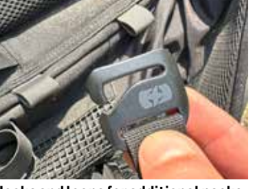
Hooks and loops for additional packs

Some of the logos are starting to peel off