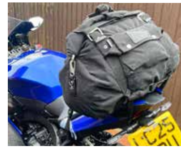
Retro looks but it works just as well on the R9 as on the Enfield

Normally attaching to the pillion seat of your bike, I actually fastened it to a rear-mounted luggage rack on the Enfield – using the additional webbing straps and large Velcro fastener at the base to keep everything fixed in place.